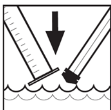
Separate the syringe and plunger and clean the syringe in warm soapy water.