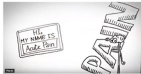
Understanding Pain in less than 5 minutes, and what to do about it